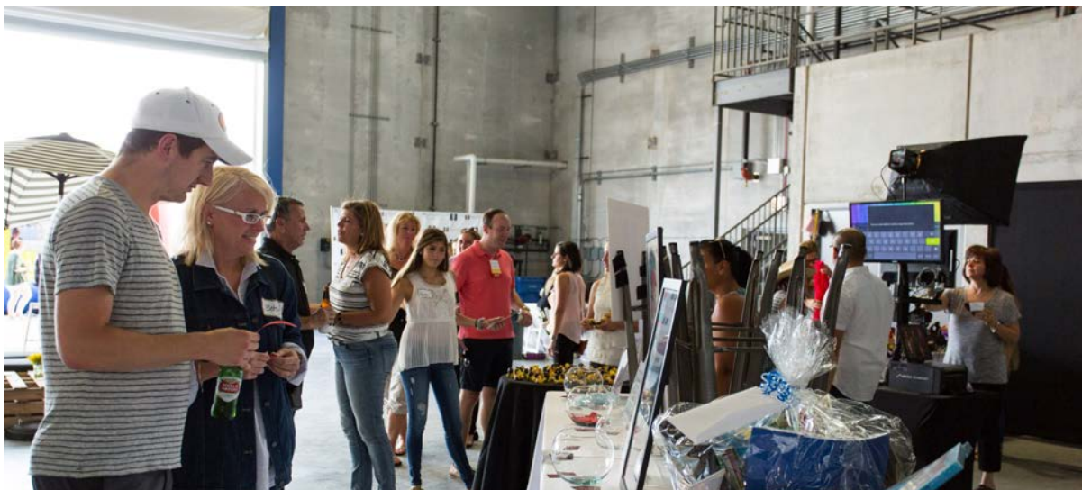
Participants tried their luck to win raffle prizes.