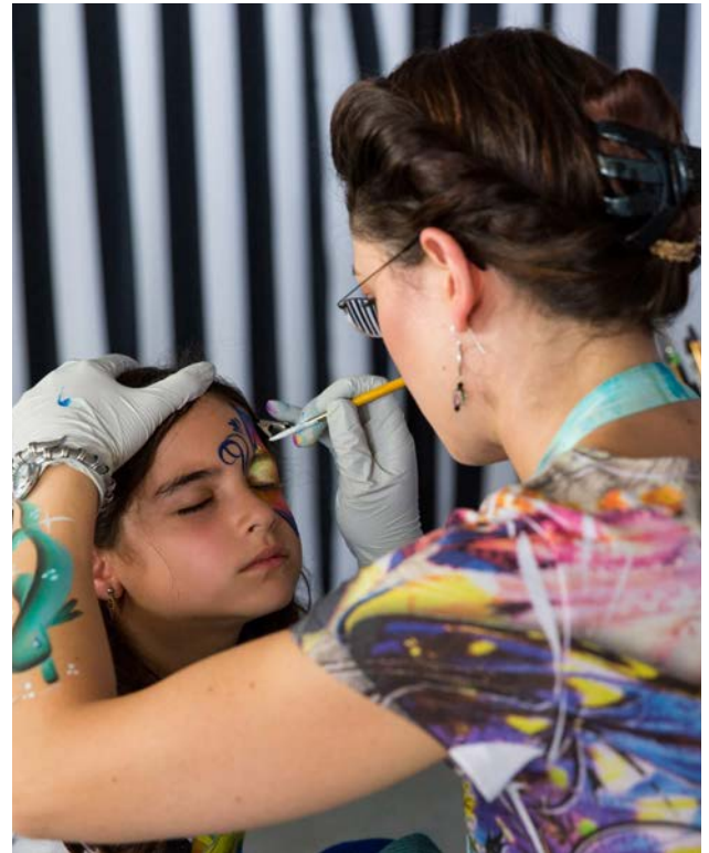
Attendees enjoyed face painting, balloon art, carnival games and more