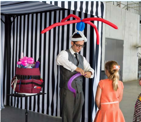
Lots to do for littles at the GI Research Foundation Donor Appreciation Picnic

To become involved with the GI Research Foundation Associates Board, please email girf@uchicago.edu .