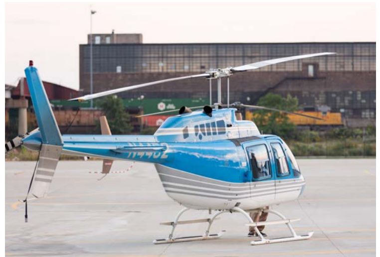
Vertiport Chicago is a working heliport on Chicago's southwest side